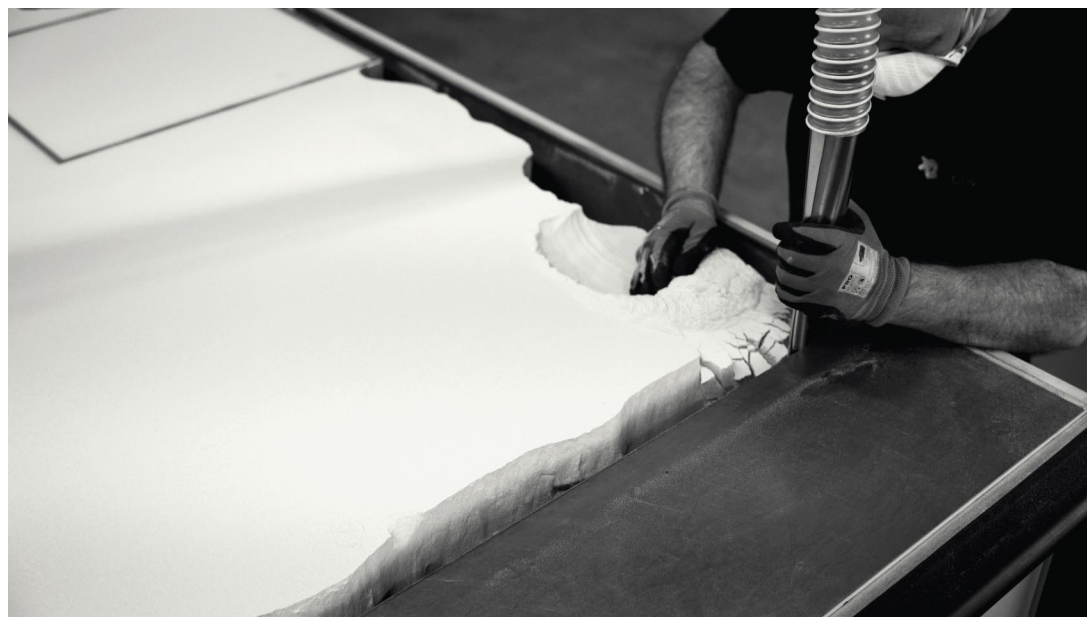
Reduction | Step 1/5

With this collaboration, our aim was not only to illuminate spaces but also to push the boundaries of organic design, harnessing the capabilities of these machines. The result is a collection that blurs the lines between art and technology, a testament to the limitless potential of visionary collaboration.