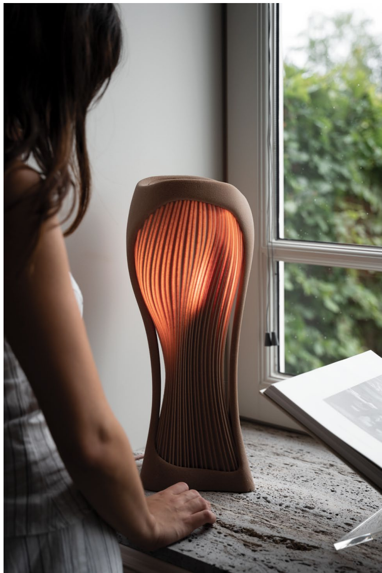
Dome Dune | Table Lamp

The piece is a reflection of the studio's dedication to artistic innovation and craftsmanship. The emphasis on biomimicry is apparent in the naturalistic form and light output. With its sophisticated form and high-quality materials, this lamp is a true representation of our commitment to artistic innovation and design excellence.